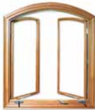
French Chateau Casement (Camber Top)