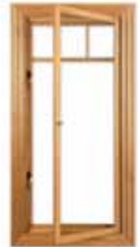
Push Out Casement