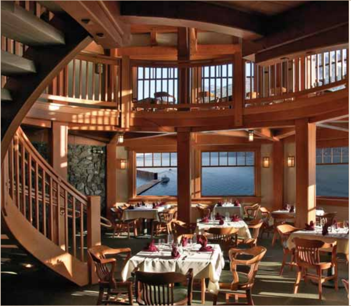
Douglas Fir Fixed Casements with Simulated Divided Lites