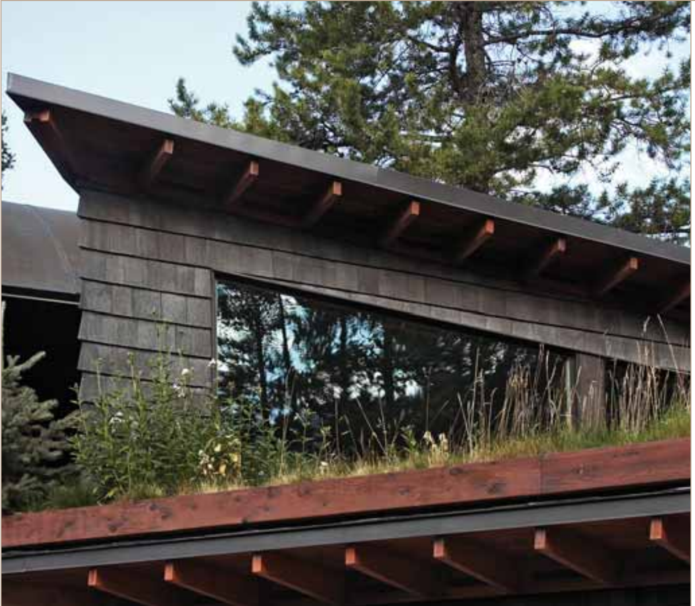
Rakehead Picture window