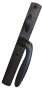
Verona Handle (Rustic Bronze)