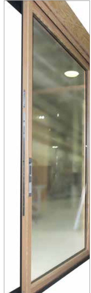
Multi-point handle system