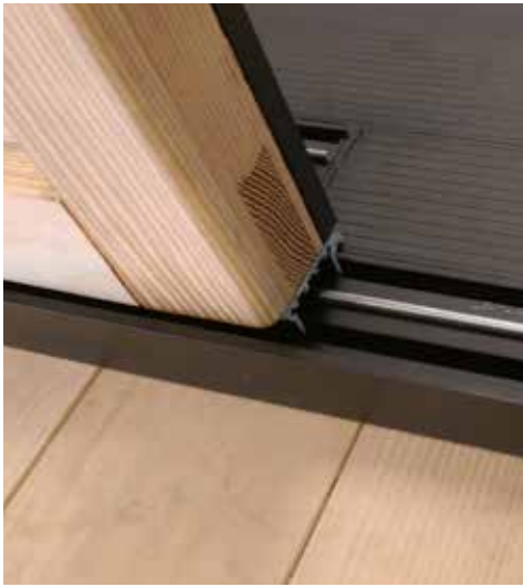
Multi-slide raised sill track