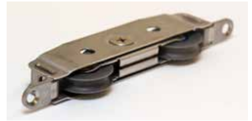
Easy glide low resistance movement