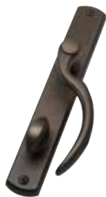
Fontana Handle (PVD Bronze)