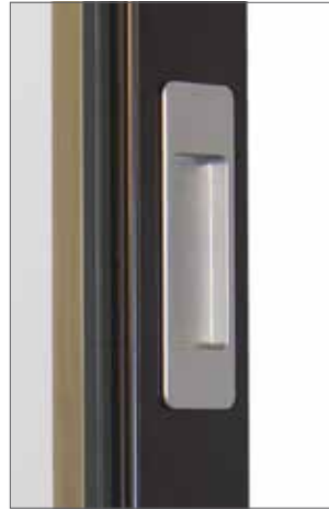
Exterior pull (Silver metallic)