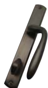
Botticelli Handle (Oil Rubbed Bronze)