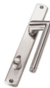
Mercury Handle (PVD Satin Nickel)