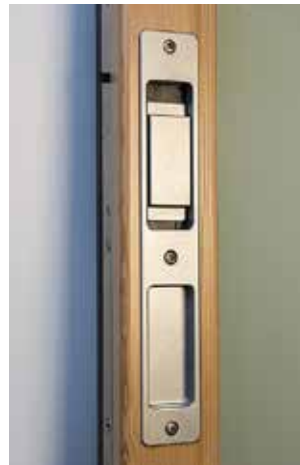
Multi-point flush handle (Silver metallic)