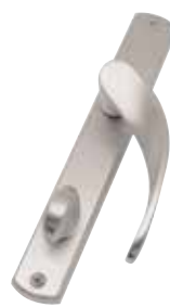
Volo Handle (PVD Satin Nickel)