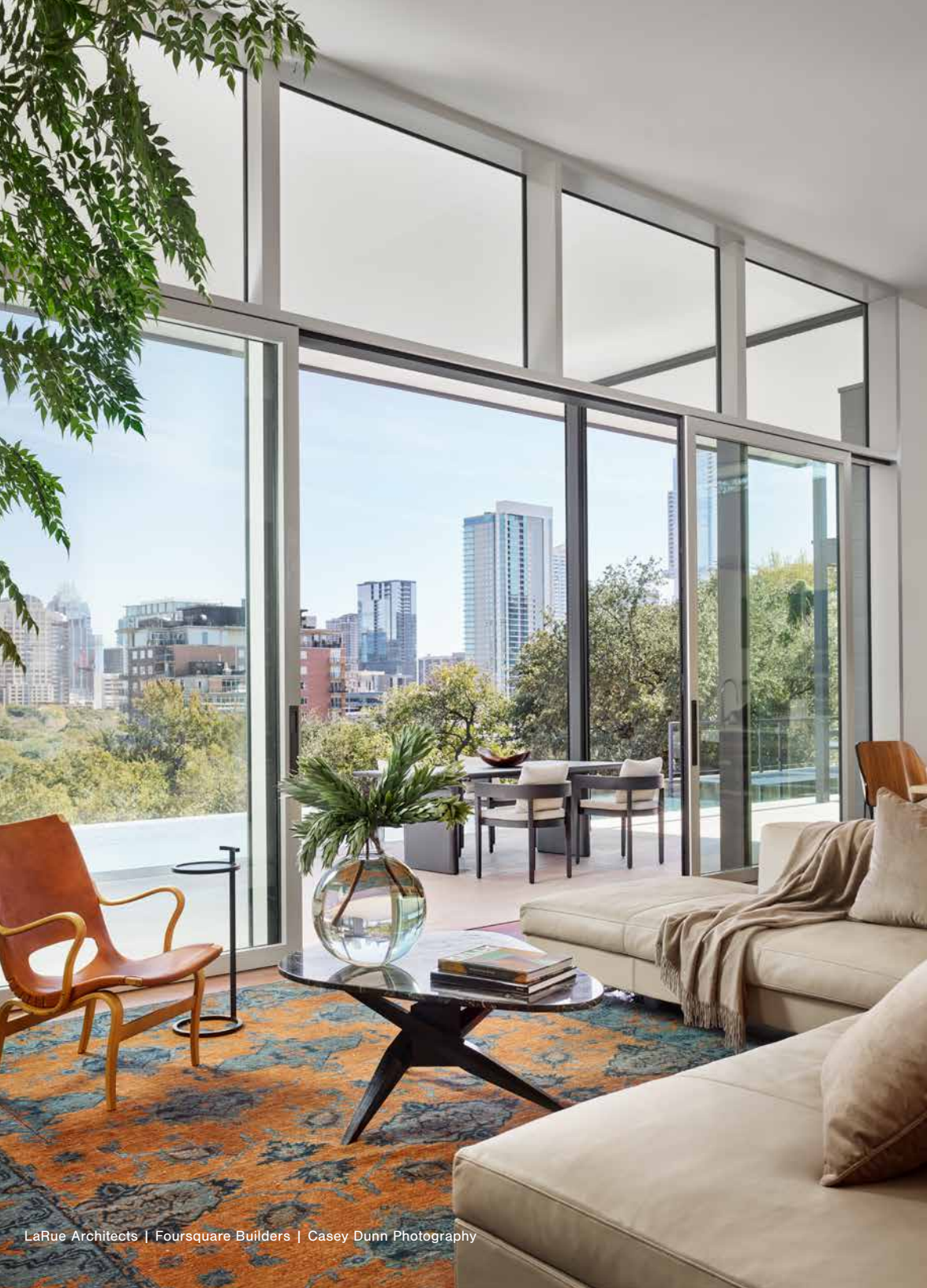
LaRue Architects | Foursquare Builders

Monolithic, dual, and triple-glazed options in a variety of Low-E coatings that align with other Loewen products